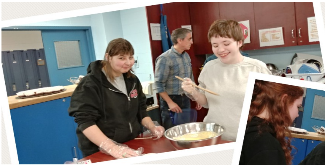
Getting ready for Blue & Gold