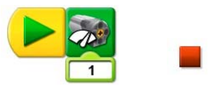
(or a number between 1 and 5)